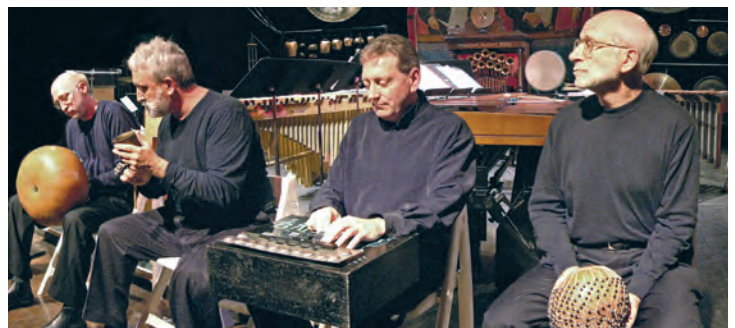
Award winning Toronto-based percussion group, Nexus, performing at SUNY Ulster, November 20, 2010.

For further information on the program's Concert Series, please check SUNY Ulster's Web site at www.sunyulster.edu . •