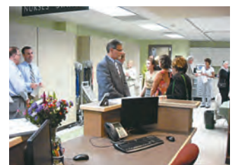
Clinical Nursing Labs Dedication, August 17, 2010