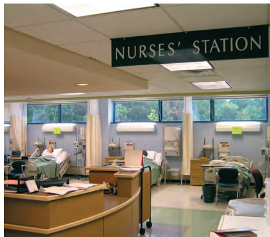
Newly designed clinical nursing labs.