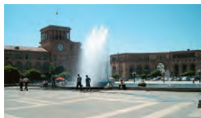
(Clockwise, starting with above) Mt. Ararat, Armenia; Cascade Yerevan, Armenia; Church of St. John Kaneo, Lake Ohrid, Macedonia circa 13th Century; Republic Square Fountain, Armenia.