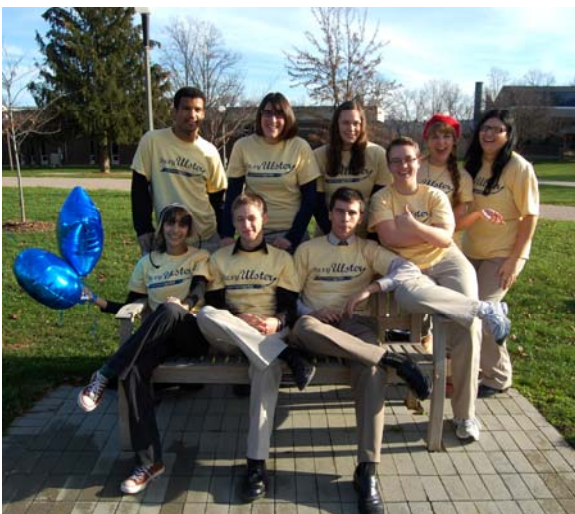
SUNY Ulster's Student Ambassadors on the job at Prospective Student Day last December.